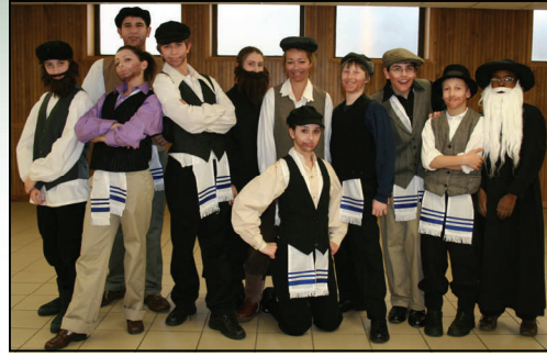
Cast from the Jr. High production of "Fiddler on the Roof"