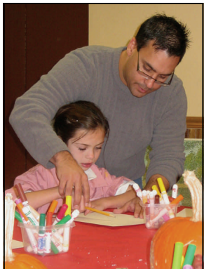
A parent volunteer helps a student during the PA's Meet the Masters art program.